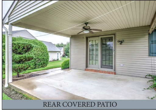
REAR COVERED PATIO