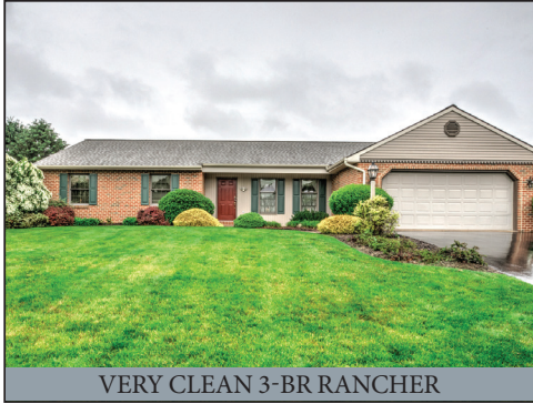
VERY CLEAN 3-BR RANCHER

TUESDAY JULY 22, 2025 @ 5:00 PM * R.E. @ 7:00 PM