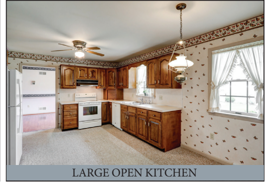
LARGE OPEN KITCHEN

LOCATED AT: 7 Kurtz Dr. Lititz PA 17543 * Warwick Township