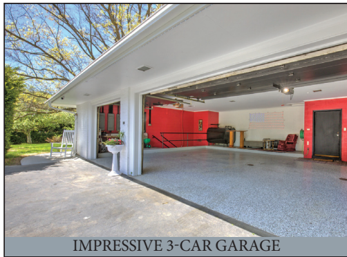
IMPRESSIVE 3-CAR GARAGE