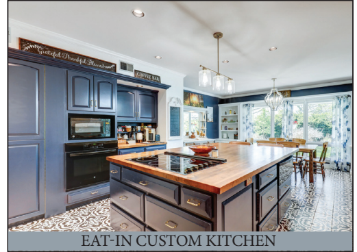
EAT-IN CUSTOM KITCHEN