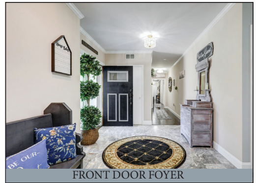
FRONT DOOR FOYER