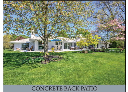
CONCRETE BACK PATIO

LOCATED AT: 1800 Fieldcrest Rd. Lebanon, PA 17046 * North Cornwall Twp