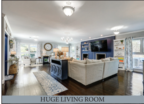
HUGE LIVING ROOM