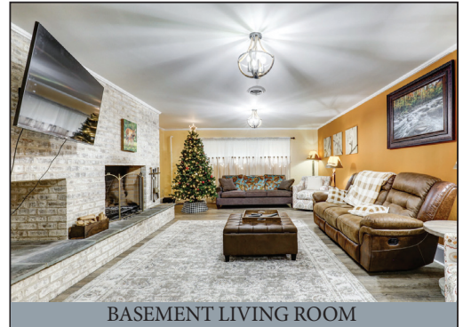
BASEMENT LIVING ROOM

level has an inviting 24'x 14.5' visitation room w/ huge brick fireplace; 12'x 8' office area; 18'x 18' storage room; 34'x 16' utility/work area/woodshop room w/ second stairway to garage. 400-amp electric service; desirable multi-zone oil fired furnace & central A/C; public water w/ newer Brita-Pro softener; on-site septic system; Cornwall-Lebanon School District; desirable North Cornwall Twp; taxes approx. $10,349.