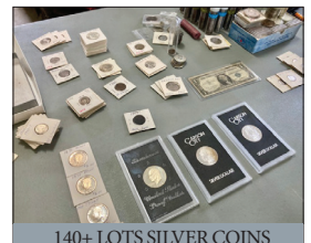
140+ LOTS SILVER COINS