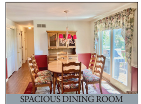
SPACIOUS DINING ROOM