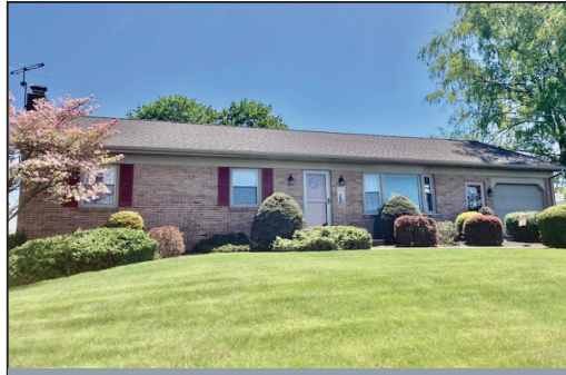
1,269 SQ. FT. 3-BDRM BRICK RANCHER