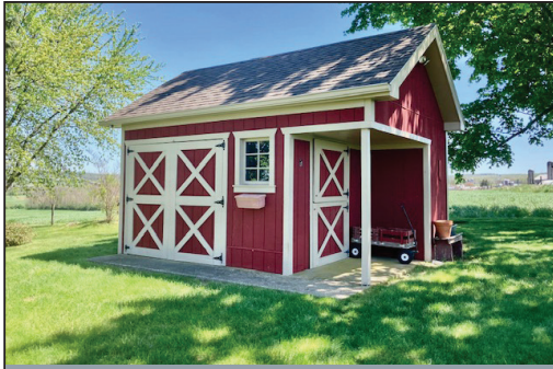
14' X 12' UTILITY BARN

SAT. JUNE 21, 2025 @ 8-AM/Real Estate @ 1-PM