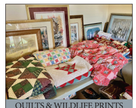
QUILTS & WILDLIFE PRINTS