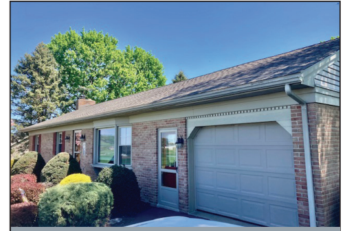
ATTACHED 1-CAR GARAGE * .52-AC. LOT

Located at: 152 Brendle Rd. East Earl, Pa. East Earl Twp. Lancaster Co.