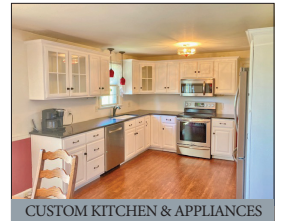
CUSTOM KITCHEN & APPLIANCES

Terms: Cash, PA check or credit card w/3% fee. Food by Churchtown Ladies Aux. Sale held under tent, bring a chair.