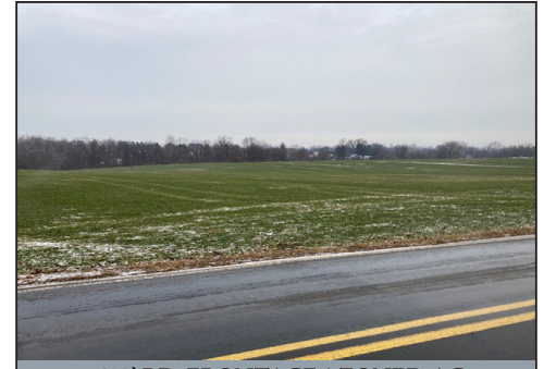
610' RD. FRONTAGE * ZONED AG

Located along Locust St. Leola, Pa. W. Earl Twp. Lancaster Co. CV Schools