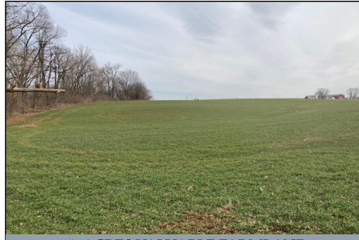
18-ACRES VALUABLE FARMLAND