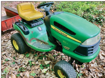
JOHN DEERE LAWN TRACTOR

COINS 93-LOTS @ 9-AM: Silver Peace & Morgan dollars, Silver Eagles; Silver halves, quarters, dimes, Wheat pennies, etc.