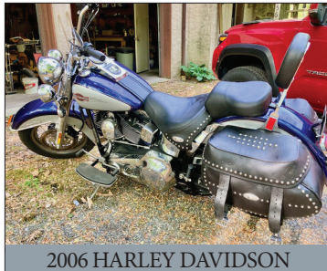
2006 HARLEY DAVIDSON

SATURDAY, JULY 12, 2025 @ 9-AM/Real Estate @ 1-PM