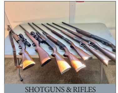
SHOTGUNS & RIFLES

GUNS: Savage .303 cal. lever action rifle w/octagon barrel; Savage .303 cal. lever action rifle; Remington model 121 .22 S/L rifle pump; Ithaca Featherlight model #37 .12-ga. pump; Remington Magnum model 870 LW Wingmaster .20-ga. pump; Marlin 917V .17 cal. HMR bolt-action w/3x9 scope; Remington 870 Magnum .12-ga. pump; Remington Gamemaster model 760 30.06 pump rifle w/3x9 scope; Handguns: H&R mod 929 .22 LR revolver 9-shot; US .22 cal. revolver 5-shot; H&A Forehand model 1901 5-shot revolver; M&P 9 shield Smith & Wesson 9MM pistol (new) 2-clips; Volcanic 22 Type C .22 cal. blank pistol 6-shot; lots of misc. ammo.