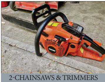
2-CHAINSAWS & TRIMMERS

PERSONAL PROPERTY: Craftsman 5600 watt generator; Craftsman stacking toolbox; wrench & socket sets; air compressor; Huskee 22-Ton log splitter; John Deere LA100lawn tractor; Honey Bee hives & extractor accessories; flat bottom fishing boat w/motor; TORO Z-turn mower 42" cut; Echo chainsaw; leaf blower; battery powered chainsaw (nice); 2-lawn carts; wheelbarrow; lots of hand & power tools; cast iron kettle; old lunch boxes; Tonka toy cars & trucks; Winross trucks; farm toys; oil lamps; LOTS OF Baseball Cards; 33's records; spinning wheel; cedar chest; 4-pc bdrm suite; desk; custom oak ext. table & 6-chairs; lots of nice wall art prints; picnic table w/benches; old Belwin saxophone; early rope bed; plus much more.