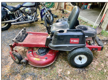
TORO Z-TURN MOWER

Terms: Cash, PA check or credit card w/3% fee. Sale held under tent, bring a chair; good food provided by Churchtown aux.