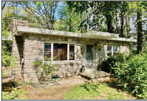
2-BDRM STONE COTTAGE * 1.12-ACRES!

SATURDAY, JULY 12, 2025 @ 9-AM/Real Estate @ 1-PM