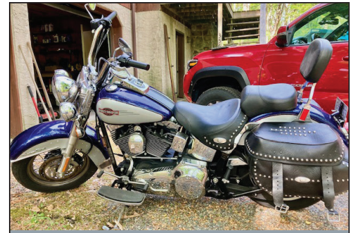
2006 HARLEY DAVIDSON SOFTAIL CLASSIC

Located at 340 & 356 Twin County Rd. (Rt. 10) Morgantown, Pa. Caernarvon Twp. Lancaster Co.