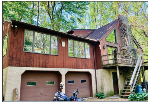
3-BDRM 2-BATH HOME W/GARAGE * 2.40-ACRES