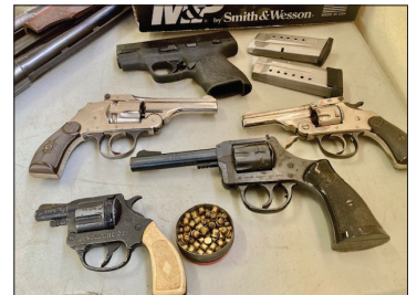
HANDGUNS & LOTS OF AMMO

COINS 93-LOTS @ 9-AM: Silver Peace & Morgan dollars, Silver Eagles; Silver halves, quarters, dimes, Wheat pennies, etc.