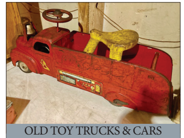
OLD TOY TRUCKS & CARS

PERSONAL PROPERTY: Craftsman 5600 watt generator; Craftsman stacking toolbox; wrench & socket sets; air compressor; Huskee 22-Ton log splitter; John Deere LA100lawn tractor; Honey Bee hives & extractor accessories; flat bottom fishing boat w/motor; TORO Z-turn mower 42" cut; Echo chainsaw; leaf blower; battery powered chainsaw (nice); 2-lawn carts; wheelbarrow; lots of hand & power tools; cast iron kettle; old lunch boxes; Tonka toy cars & trucks; Winross trucks; farm toys; oil lamps; LOTS OF Baseball Cards; 33's records; spinning wheel; cedar chest; 4-pc bdrm suite; desk; custom oak ext. table & 6-chairs; lots of nice wall art prints; picnic table w/benches; old Belwin saxophone; early rope bed; plus much more.