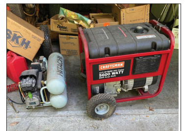
CRAFTSMAN 5600W GENERATOR

Terms: Cash, PA check or credit card w/3% fee. Sale held under tent, bring a chair; good food provided by Churchtown aux.