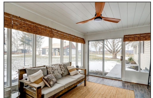
INVITING REAR SUNROOM