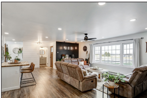
FRONT LIVING AREA & WINDOW