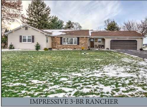
IMPRESSIVE 3-BR RANCHER