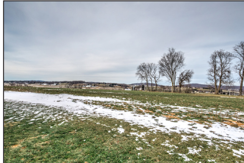
VIEW OF SURROUNDING AREA