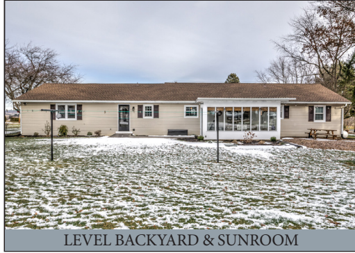
LEVEL BACKYARD & SUNROOM