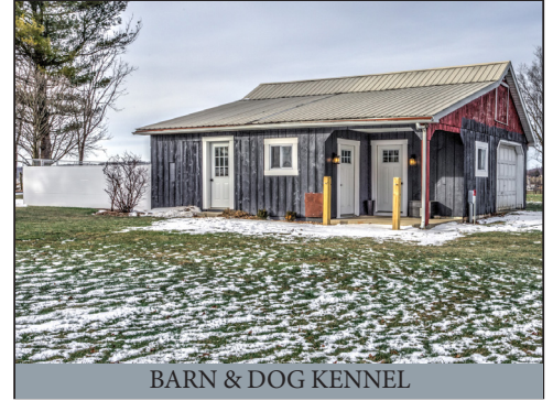
BARN & DOG KENNEL

LOCATED AT: 1538 Clay Rd. Ephrata, PA 17522 * Elizabeth Township