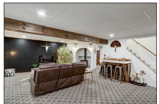
MAJESTIC FINISHED BASEMENT