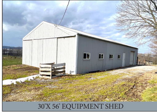
30'X 56' EQUIPMENT SHED