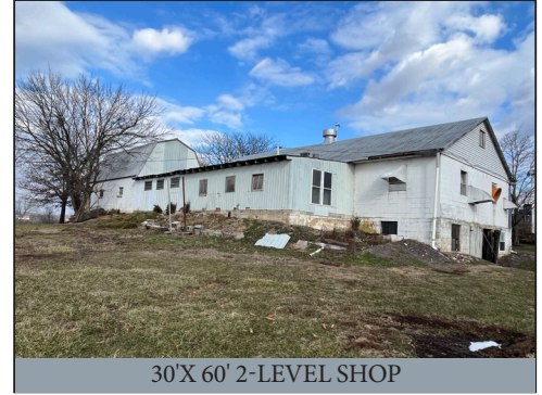
30'X 60' 2-LEVEL SHOP

LOCATED AT: 489 Frysville Rd. Ephrata, PA 17522 * Earl Township