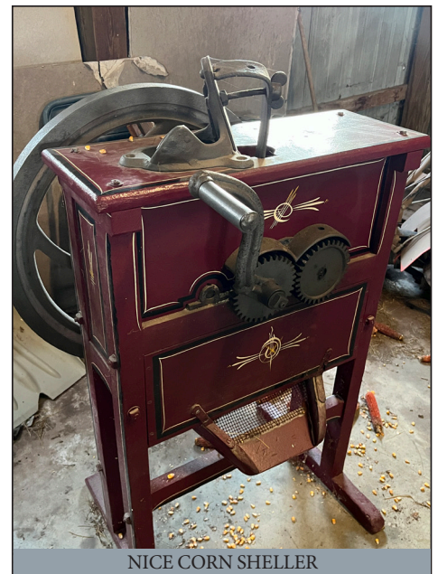
NICE CORN SHELLE