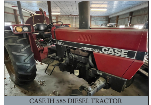
CASE IH 585 DIESEL TRACTOR