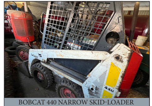
BOBCAT 440 NARROW SKID-LOADER