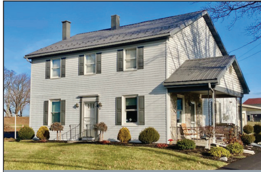
2,176 SQ. FT. 5-BDRM HOME * .44-AC.