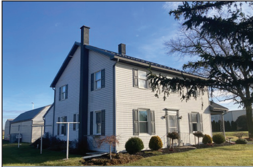
5-BDRM 1.5 BATH 2-STORY HOME

5-BDRM 1.5-BATH 2-STORY HOME * .44-ACRE LOT! 37'x20' 2-STALL HORSE BARN/GARAGE * 18'x12' SHED THURSDAY, FEBRUARY 13, 2025 @ 4-PM