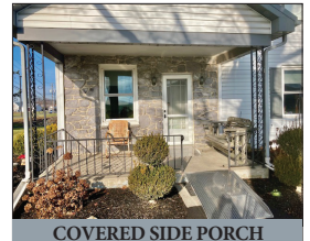
COVERED SIDE PORCH

For Photos & Detailed Listing Visit www.martinandrutt.com