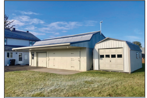
37'x20' HORSE BARN/GARAGE * SHED

Located at 511 N. Railroad Ave. New Holland, Pa. Earl Twp. Lancaster Co.