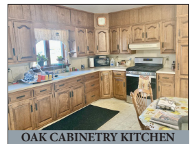
OAK CABINETRY KITCHEN