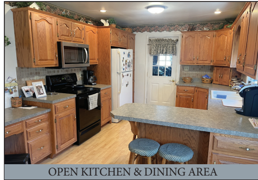
OPEN KITCHEN & DINING AREA