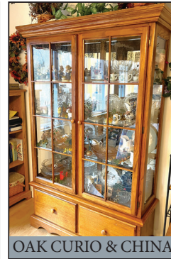
OAK CURIO & CHINA