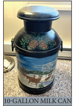
10-GALLON MILK CAN

LOCATED AT: 1331 Woodland Circle, Denver, PA 17517 * Brecknock Twp.