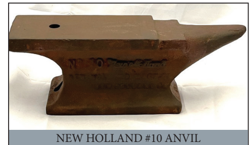
NEW HOLLAND #10 ANVIL