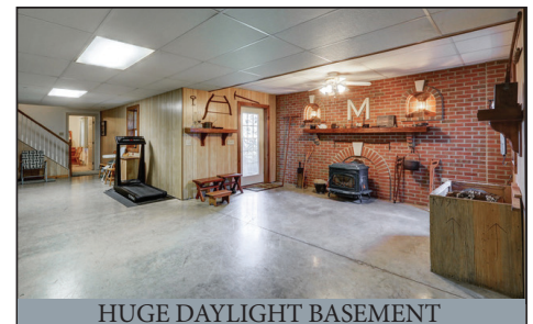
HUGE DAYLIGHT BASEMENT