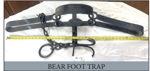
BEAR FOOT TRAP

Please visit our website www.martinandrutt.com or Facebook or Instagram