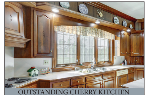
OUTSTANDING CHERRY KITCHEN