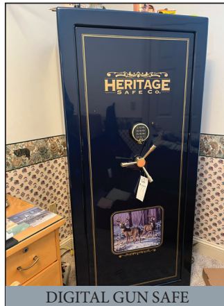
DIGITAL GUN SAFE