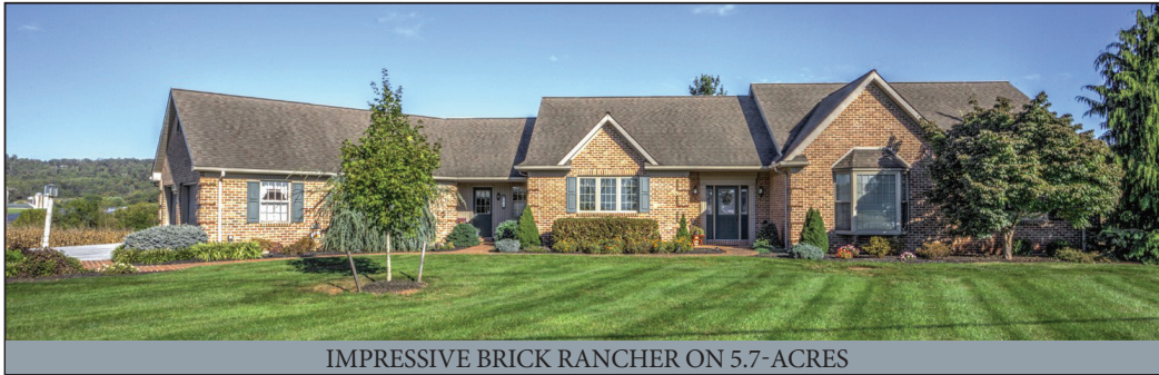
IMPRESSIVE BRICK RANCHER ON 5.7-ACRES

FRI. MAY 9 @ 9-AM & SAT. MAY 10, 2025 @ 9-AM * R.E. @ 1-PM