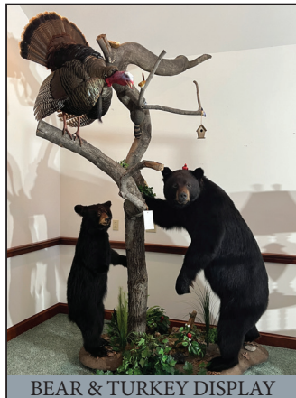
BEAR & TURKEY DISPLAY