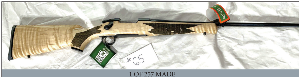
1 OF 257 MADE