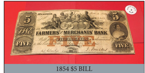
1854 $5 BILL