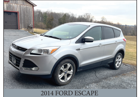
2014 FORD ESCAPE

SATURDAY, SUV, FURNITURE & HOUSEHOLD: Silver 2014 Ford Escape SE, AWD, 71,000 miles, current inspection, power seat, back-up camera, very nice; Kincade 4-pc. cherry bedroom suite w/ Queen poster bed; 3-pc. cedar bedroom suit w/ bookcase bed; 3-pc. blonde bedroom suite; antique blanket chest w/ "K.O.W. 1908"; refinished antique jelly cupboard; "carpet ball" game; 10+ nice folding chairs; extension kitchen table w/ boards; (2) lazy-boy recliners; lazy-boy love seat; other upholstered furniture; oak dropleaf table & chairs; (4) walnut kitchen chairs; toy chest; Q-A console table; local-made kneehole desk; oak hall cabinet; several benches; bookcases w/ glass doors; oak parlor table; corner mahog. Nightstand; handmade cherry storage cabinet; marble top end table; several end table & lamps; speed-queen washer & dryer; small Danby upright freezer; Frigidaire 20-CU upright freezer; Bernina sport 801 port. Sewing machine; Idly-Tyme marble-roller clock; Massey Furgason 8680 pedal tractor by Ertl; working train layout; K-Line #6200 locomotive w/ tender & 3 passenger cars; K-Line Hershey #2333 locomotive & cars; misc. train controllers; misc. train display items; Oneida stainless steel flatware in box; (6) peanut butter jars; clean, small home appliances; several coolers; lots of home décor; oven roasters; stainless steel kettles; canning jars; lots of clean towels & bedding; Rowe pottery; clean children toys; plus more unlisted.