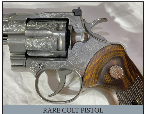
RARE COLT PISTOL