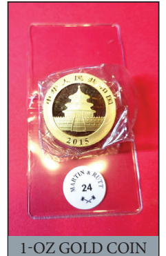
1-OZ GOLD COIN