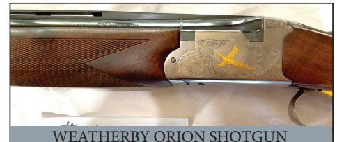
WEATHERBY ORION SHOTGUN