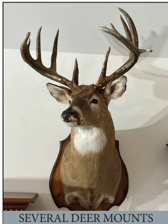
SEVERAL DEER MOUNTS