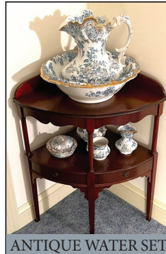
ANTIQUE WATER SET