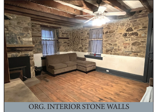
ORG. INTERIOR STONE WALLS