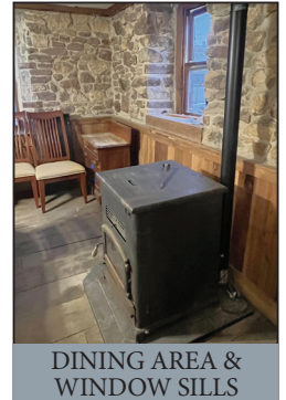
DINING AREA & WINDOW SILLS