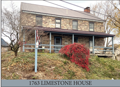
1763 LIMESTONE HOUSE