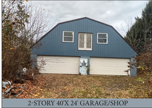
2-STORY 40'X 24' GARAGE/SHOP