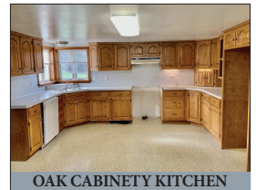
OAK CABINETY KITCHEN