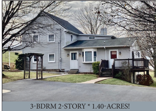
3-BDRM 2-STORY * 1.40-ACRES!