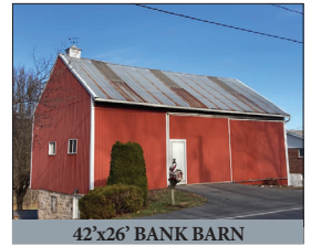
42'x26' BANK BARN

For Photos & Detailed Listing Visit www.martinandrutt.com