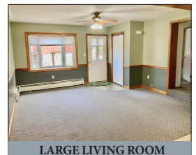
LARGE LIVING ROOM