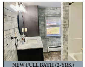
NEW FULL BATH (2-YRS.)