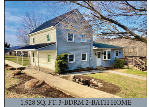
1,928 SQ. FT. 3-BDRM 2-BATH HOME

Located at 1200 Mt. Airy Rd. Stevens, Pa. 17578 W. Cocalico Twp. Lancaster Co.