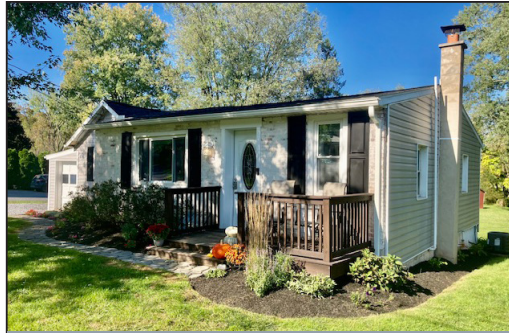
2-BDRM 1-BATH RANCHER * .61-AC LOT