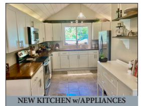
NEW KITCHEN w/APPLIANCES