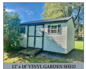
12' x 18' VINYL GARDEN SHED