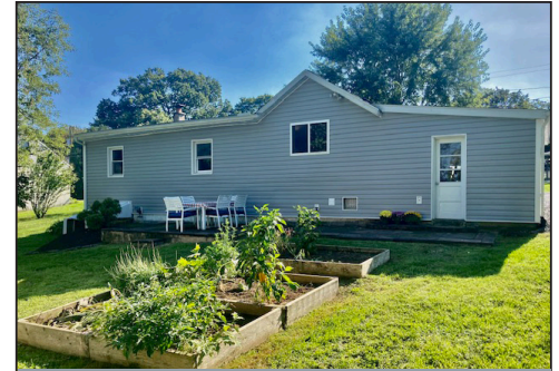
RURAL SETTING * LARGE BACKYARD

Located at: 765 Maple St. (Hopeland) Lititz, Pa. Clay Twp. Lancaster Co.