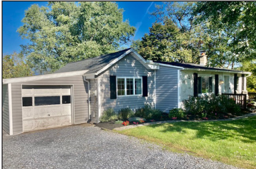
1,013 SQ. FT. RANCHER W/GARAGE

2-BDRM 1-BATH RANCHER w/1-CAR GARAGE * .61-AC. LOT MANY VALUABLE UPDATES THROUGHOUT! * 12'x18' SHED WEDNESDAY, NOVEMBER 13, 2024 @ 4:00 PM