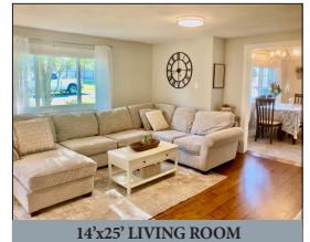
14'x25' LIVING ROOM

FOR PHOTOS & COMPLETE LISTING VISIT www.martinandrutt.com