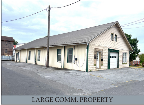
LARGE COMM. PROPERTY