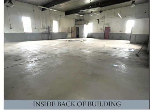
INSIDE BACK OF BUILDING

LOCATED AT: 404 N. Earl St. Terre Hill, PA * Watt St. Terre Hill, PA