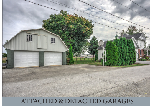
ATTACHED & DETACHED GARAGES