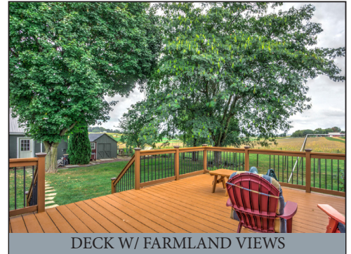
DECK W/ FARMLAND VIEWS

BRIEF TERMS: $40,000 down payment the day of auction, balance in 60-days or before. This auction is held under the terms of Attorney Justin Bollinger 717-291-1700.