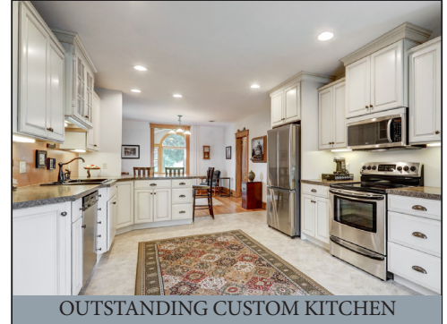
OUTSTANDING CUSTOM KITCHEN