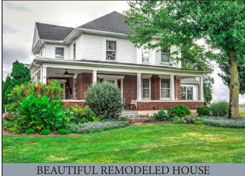
BEAUTIFUL REMODELED HOUSE