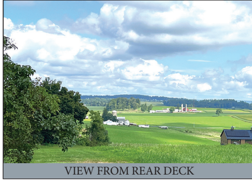
VIEW FROM REAR DECK