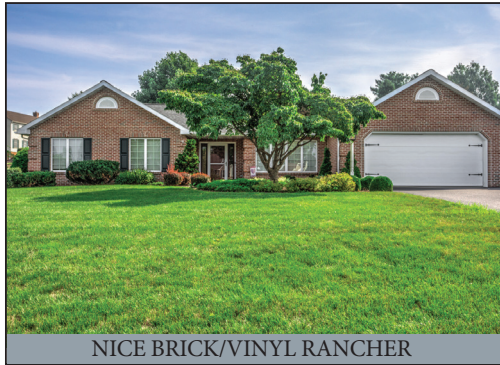
NICE BRICK/VINYL RANCHER