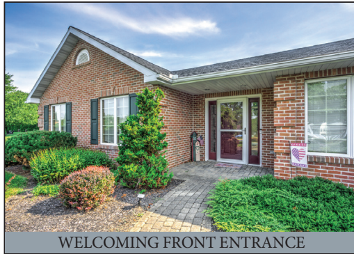
WELCOMING FRONT ENTRANCE