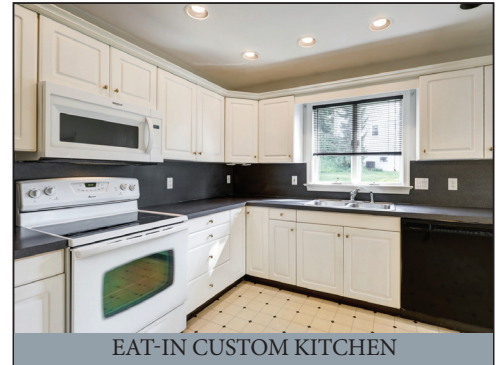
EAT-IN CUSTOM KITCHEN

LOCATED AT: 69 N. Whisper Ln. New Holland, PA * (The Willows Neighborhood)