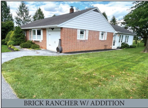
BRICK RANCHER W/ ADDITION

BEAUTIFUL 3-BEDROOM BRICK RANCHER * .74-ACRE COUNTRY LOT PERSONAL PROPERTY * 2014 GRAND CHEROKEE * (2) MARTIN GUITARS * TOOLS SATURDAY OCT. 19, 2024 @ 8:30-AM * R.E. @ 1:00 PM