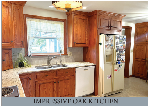
IMPRESSIVE OAK KITCHEN