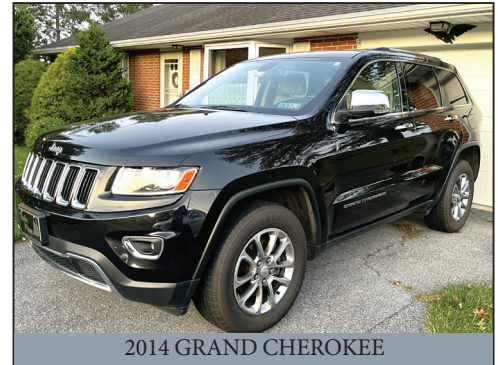
2014 GRAND CHEROKEE

LOCATED AT: 1526 Brunnerville Rd. Lititz, PA 17543