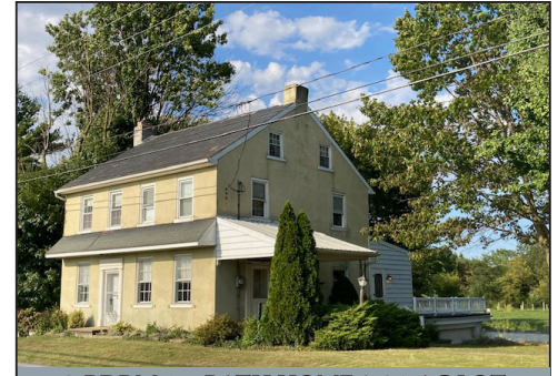
3-BDRM 1.5-BATH HOME * .34-AC. LOT

Located at: 296 Reading Rd. East Earl, Pa. E. Earl Twp. Lancaster Co.