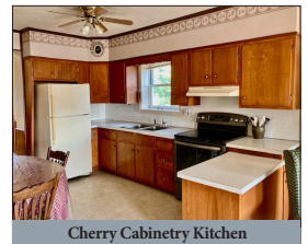
Cherry Cabinetry Kitchen

For photos & complete listing visit www.martinandrutt.com