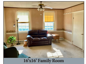
16'x16' Family Room