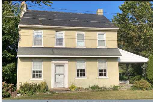
1800'S 2-STORY FARMHOUSE