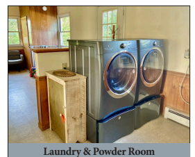
Laundry & Powder Room