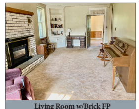
Living Room w/Brick FP