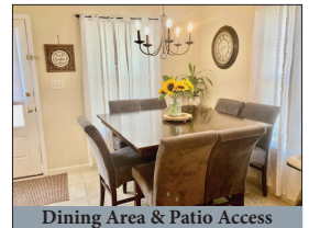
Dining Area & Patio Access