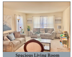
Spacious Living Room