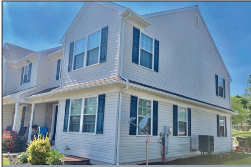
END UNIT (NEW 2008) TOWNHOUSE