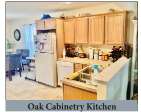
Oak Cabinetry Kitchen