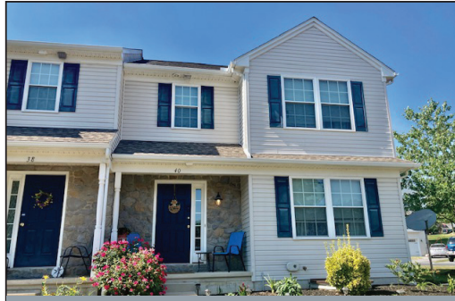
1,641 SQ. FT. 3-BDRM 2.5-BATH HOME