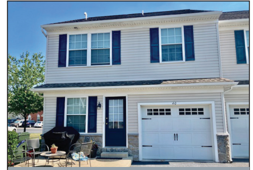
1-CAR GARAGE & PARKING AREA

Located at 40 Bradford Drive, Leola, PA U. Leacock Twp. CV Schools