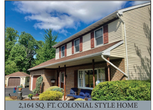
2,164 SQ. FT. COLONIAL STYLE HOME

Located at 5009 Apple Ln. Mohnton, Pa. Brecknock Twp. Berks Co.