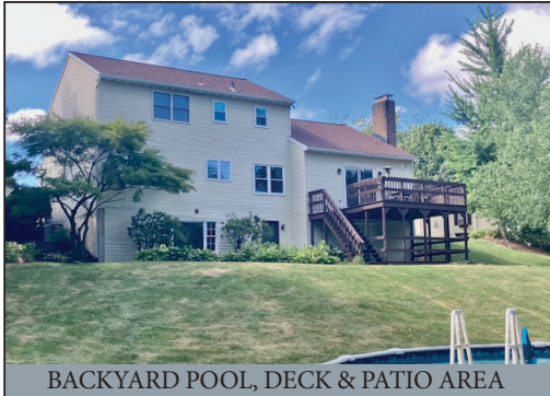
BACKYARD POOL, DECK & PATIO AREA

4-BDRM 2.5-BATH 2,164 Sq. Ft. 2-STORY COLONIAL * 1.08-ACRES! ATTACHED 2-CAR GARAGE * DETACHED 24'x14' GARAGE/GAZEBO THURSDAY, AUGUST 22, 2024 @ 6:30 PM