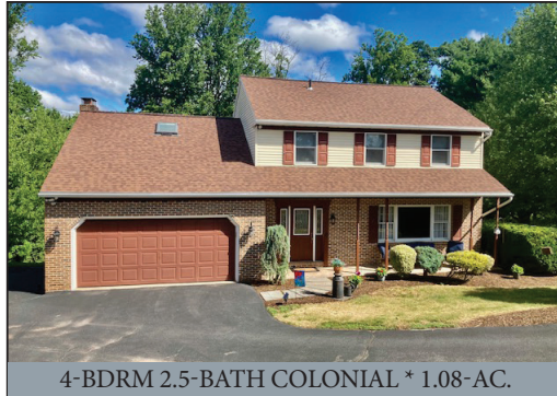
4-BDRM 2.5-BATH COLONIAL * 1.08-AC.