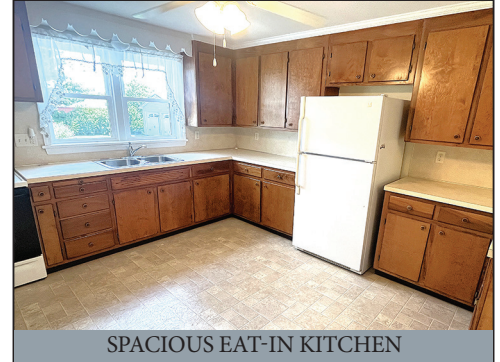
SPACIOUS EAT-IN KITCHEN

LOCATED AT: 434 28th Division Hwy Lititz, PA 17543