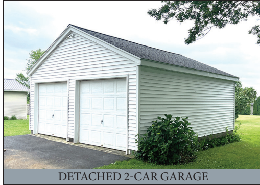
DETACHED 2-CAR GARAGE