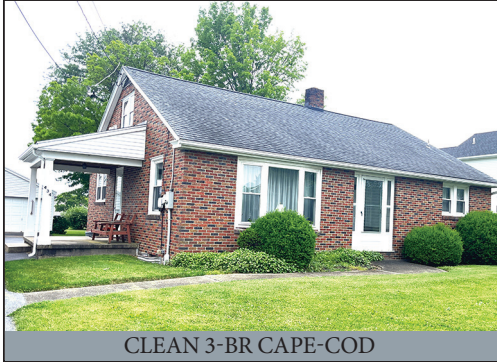
CLEAN 3-BR CAPE-COD