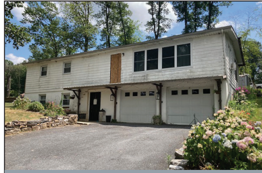
RANCHER W/GARAGE * 2.46-ACRES!