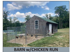
BARN w/CHICKEN RUN