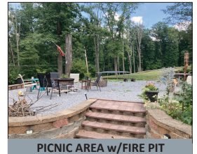
PICNIC AREA w/FIRE PIT

For photos & complete listing visit www.martinandrutt.com