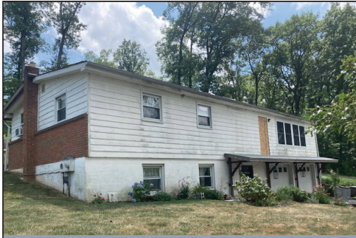
4-BDRM 1-BATH RANCHER 1,344 SQ. FT.