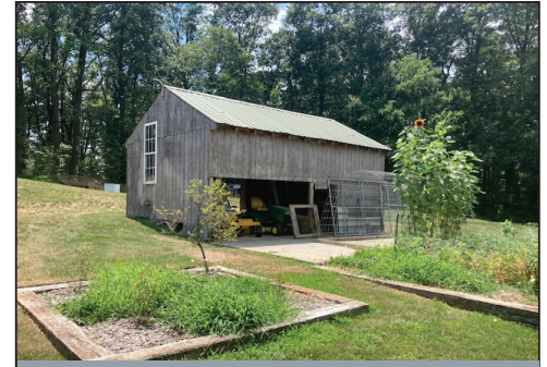
16' X 28' SMALL ANIMAL BARN

Located at 210 Dove Rd. Fredericksburg, Pa. Bethel Twp. Berks Co.