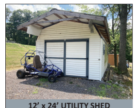
12' x 24' UTILITY SHED