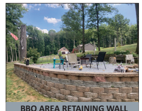
BBQ AREA RETAINING WALL