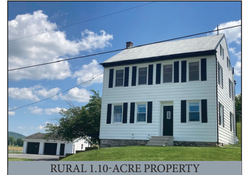
RURAL 1.10-ACRE PROPERTY

Located at 724 State Rt. 419 Myerstown, PA Millcreek Twp. Lebanon Co.