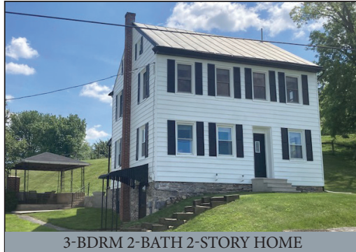
3-BDRM 2-BATH 2-STORY HOME