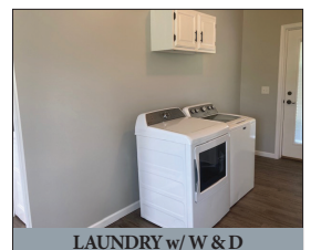
LAUNDRY w/ W & D