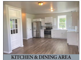
KITCHEN & DINING AREA