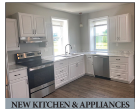
NEW KITCHEN & APPLIANCES

For photos & complete listing visit www.martinandrutt.com