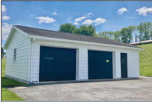
22'X36' 2-BAY GARAGE/SHOP