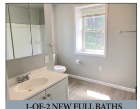
1-OF-2 NEW FULL BATHS