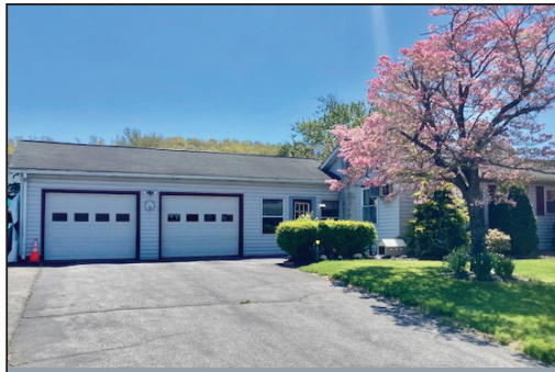
3-BDRM RANCHER * .66-AC. LOT

3-BDRM RANCHER w/1-BDRM APARTMENT * .66-ACRE LOT 2-CAR GARAGE * (2) STORAGE SHEDS * LARGE GARDEN AREA JOHN DEERE MT * 8-N FORD * ARCTIC CAT 4x4 ATV * 2007 FORD 4x4 PICKUP GUNS, AMMO & CROSSBOW * ATLAS TRAILER * 17' BLUE FIN FISHING BOAT SATURDAY, JULY 13, 2024 @ 9-AM/Real Estate @ 1-PM