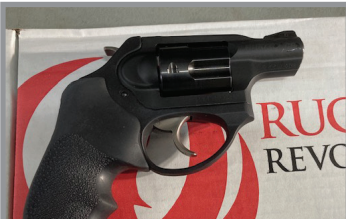
Ruger LCR 9MM (NIB)