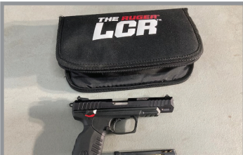
Ruger .22 Pistol