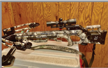
Ten Point Crossbow