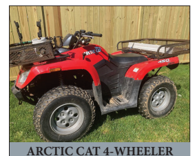
ARCTIC CAT 4-WHEELER