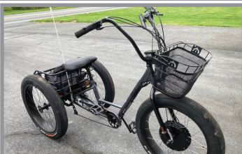
New Baja Sun E-Bike

Truck, Boat, ATV, Tractors & Trailer: 2007 Ford Explorer 4x4 white pickup 123k mi.; leather, power loaded; 17' Blue Fin boat w/60hp Mercury & Minn Kota trolling motor; Red 2013 Arctic Cat 450 4x4 ATV w/304 mi., snow blade; restored John Deere MT & Ford 8N tractors; 2018 Atlas 12'x6' single axle cargo trailer w/ramp door; Husqvarna LTH 17hp mower; Troy Bilt pony tiller.