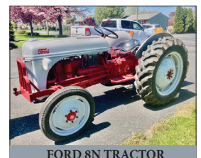
FORD 8N TRACTOR