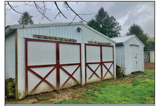
24'X20' GARAGE & SHED

Located at: 1290 Sheephill Rd. East Earl, Pa. East Earl Twp. Lancaster Co.