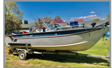
17' Blue Fin Sport Boat

Terms: Cash, PA check or credit card w/3% fee. Food by GSFR aux. Sale held under tent, bring a chair.