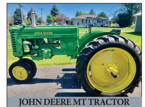
JOHN DEERE MT TRACTOR