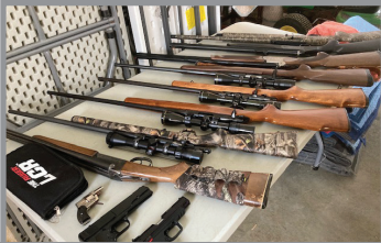
Nice Firearm Collection

3-BDRM RANCHER w/1-BDRM APARTMENT * .66-ACRE LOT 2-CAR GARAGE * (2) STORAGE SHEDS * LARGE GARDEN AREA JOHN DEERE MT * 8-N FORD * ARCTIC CAT 4x4 ATV * 2007 FORD 4x4 PICKUP GUNS, AMMO & CROSSBOW * ATLAS TRAILER * 17' BLUE FIN FISHING BOAT SATURDAY, JULY 13, 2024 @ 9-AM/Real Estate @ 1-PM