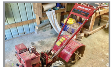
Troy Bilt Pony Tiller