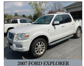
2007 FORD EXPLORER