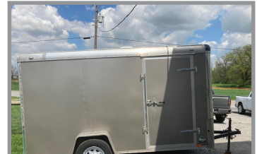
Atlas 12' Cargo Trailer