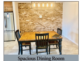
Spacious Dining Room