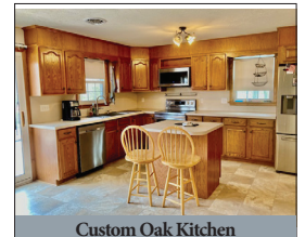
Custom Oak Kitchen