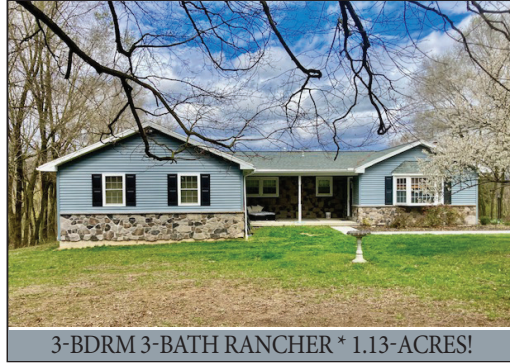
3-BDRM 3-BATH RANCHER * 1.13-ACRES!