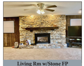
Living Rm w/Stone FP