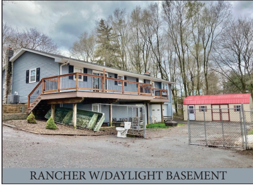
RANCHER W/DAYLIGHT BASEMENT