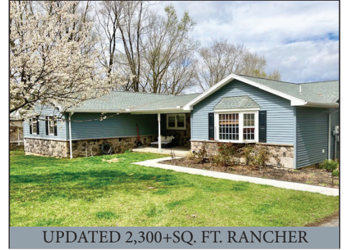
UPDATED 2,300+SQ. FT. RANCHER

Located at 20 W. Market St. Myerstown, Pa. Tulpehocken Twp. Berks Co.