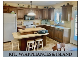
KIT. W/APPLIANCES & ISLAND

REAL ESTATE: Consists of a 1,232 sq. ft. 3-bedroom 2.5-bath (1979) rancher w/2-car garage on a .55-acre rural lot. Main floor features a 20'x13' formal living room; 19'x13.5' custom cherry cabinetry kitchen w/center island/bar; appliances included, open to dining area w/cozy aux. gas stove w/brick hearth, access to beautiful stone paver patio; laundry w/washer & dryer, mop sink; ½ bath; attached oversized 2-car garage w/workshop & attic access; 13'x14.5' master bedroom w/private full bath; 11'x13' BR #2 w/closet; 10'x10.5' BR #3 w/closet; full bath; inviting covered front porch; finished lower level includes a 25'x26' great room w/pool table area, nice 2nd kitchen w/range & dining area; Bilco egress door; 2-bonus bedrooms w/closets; canning storage; utility room w/oil furnace HW heat; central AC; water softening system; on-site well & septic; annual taxes: $3,689. Outbuilding: a 14'x10' garden shed, nice level backyard for garden!