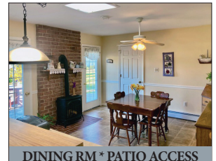
DINING RM * PATIO ACCESS