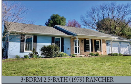
3-BDRM 2.5-BATH (1979) RANCHER