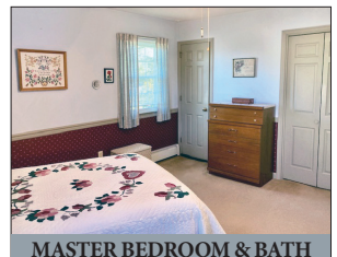
MASTER BEDROOM & BATH