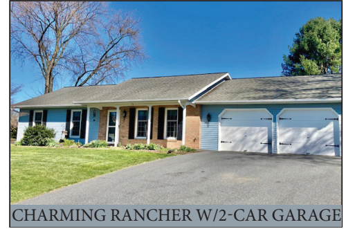
CHARMING RANCHER W/2-CAR GARAGE

Located at 407 Hilltop Rd. Strasburg, Pa. Strasburg Twp. Lancaster Co.