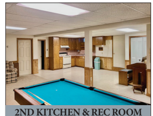
2ND KITCHEN & REC ROOM