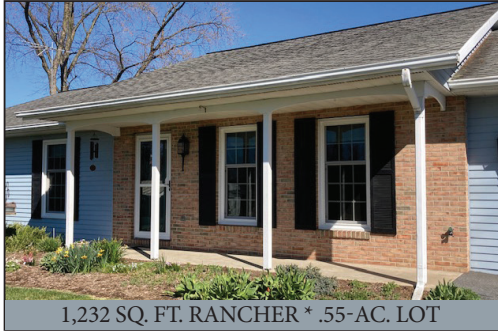
1,232 SQ. FT. RANCHER * .55-AC. LOT