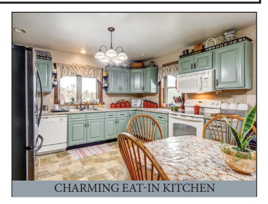
LOCATED AT: 627 Fivepointville Rd. Denver, Pa 17517

<u>DIRECTIONS</u> : From the square in Fivepointville, travel West on Fivepointville Rd for 2/3 mile to property on the left.