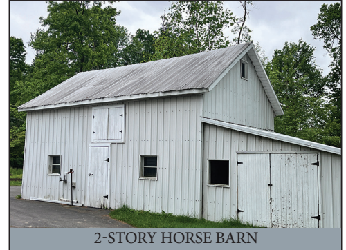
2-STORY HORSE BARN

LOCATED AT: 1116 May Post Office Rd, Quarryville PA 17566 * Eden Twp.