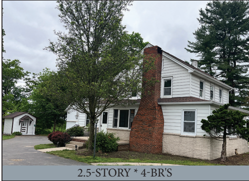
2.5-STORY * 4-BR'S