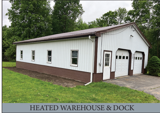
HEATED WAREHOUSE & DOCK