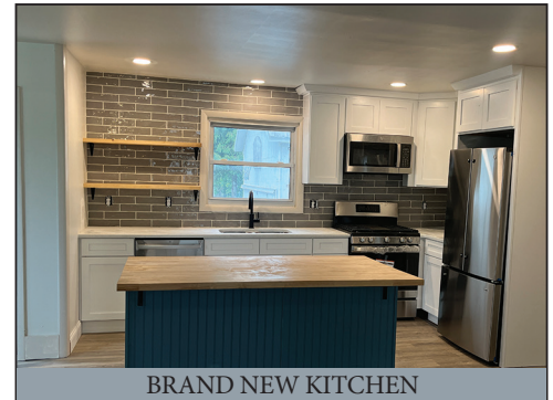
BRAND NEW KITCHEN

WAREHOUSE & BARN: A very nice L-Shaped warehouse 50'x 44' x 30' w/ 10.5' ceilings w/ steel sheeting, (2) 8'x 9' overhead doors, concrete floor, concrete block bottom 20" of the wall (the rest is framed), insulated w/ propane warm air heater, concrete truck height loading dock (forklift into building thru a overhead door), brand new steel roof 5-24. A 2-story 28'x 18' framed horse barn w/ 12' lean-to addition, dirt floor & second level storage, large sliding door access. Cute playhouse looks like an old school house. Wooded area in back of property, plenty of room for pasture. Backs up to farmland, full of potential.