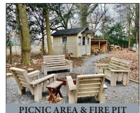
PICNIC AREA & FIRE PIT