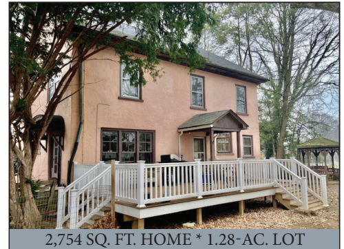
2,754 SQ. FT. HOME * 1.28-AC. LOT

Located at 2142 New Holland Pike, Lancaster, PA E. Lampeter Twp. Lancaster Co.