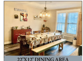
22'X12' DINING AREA