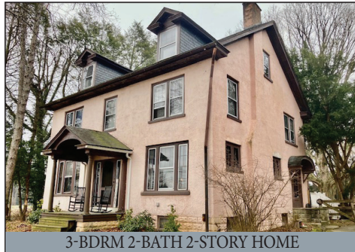
3-BDRM 2-BATH 2-STORY HOME