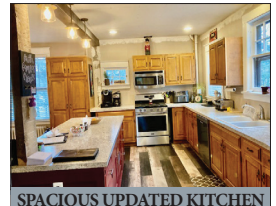
SPACIOUS UPDATED KITCHEN

For photos & detailed listing visit www.martinanddrutt.com