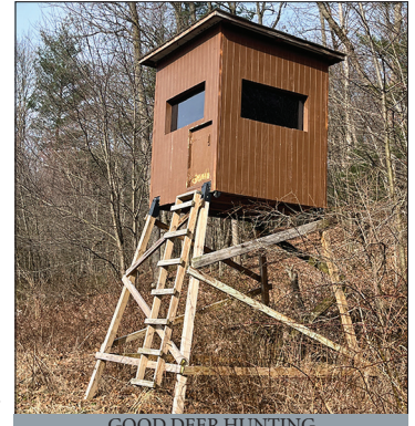
GOOD DEER HUNTING

Located at 2523 Lauver Valley Rd. Richfield, PA * Northern Juniata County & Monroe Twp.