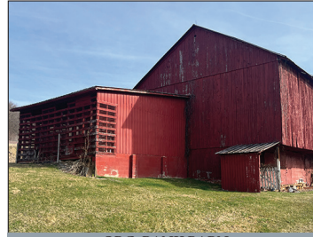
ORG. BANK BARN