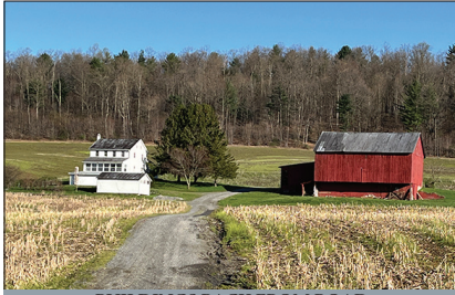
BUILDINGS BACK FROM ROAD

#1, 70-ACRE FARM * HOUSE & BARN * TILLABLE & WOODED #2, 19-ACRES OPEN & WOODED * NICE HOUSE SITE SECLUDED COUNTRY LOCATION * GOOD HUNTING SATURDAY, JUNE 1, 2024 @ 11:00 AM