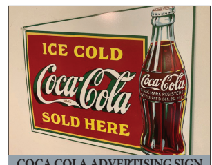
COCA COLA ADVERTISING SIGN