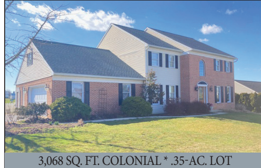
3,068 SQ. FT. COLONIAL * .35-AC. LOT