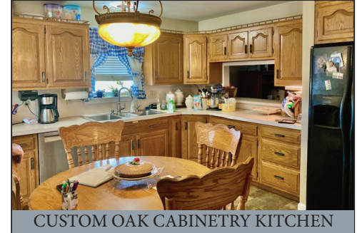
CUSTOM OAK CABINETRY KITCHEN

Located at 472 Glen Mar Ave. New Holland, Pa. Earl Twp. Lancaster Co.