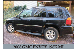
2008 GMC ENVOY 198K ML.

TERMS: Cash, PA check or credit card w/3% fee; sale held under tent bring a chair; good food provided!