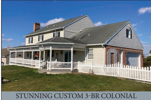
STUNNING CUSTOM 3-BR COLONIAL

3-BDRM 2.5-BATH 2-STORY 3,068 Sq. Ft. COLONIAL HOME * .35-AC. LOT 2-CAR GARAGE * CUSTOM OAK KITCHEN * FINISHED 1,000 Sq. Ft. BASEMENT 2008 GMC ENVOY * JD X300 MOWER * POOL TABLE * LAWN/GARDEN ITEMS NICE QUALITY FURNITURE * ANTIQUES & PERSONAL PROPERTY SATURDAY, MAY 4, 2024 @ 9-AM/Real Estate @ NOON