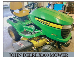
JOHN DEERE X300 MOWER