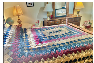
NICE QUILTS & FURNISHINGS