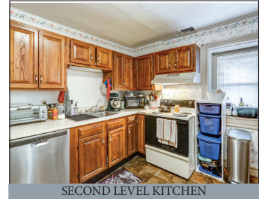
SECOND LEVEL KITCHEN

Located at 1265 West Swartzville Rd. Reinholds PA 17569 * E. Cocalico Twp