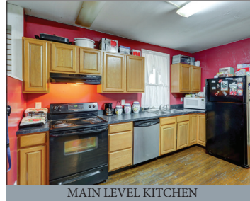
MAIN LEVEL KITCHEN