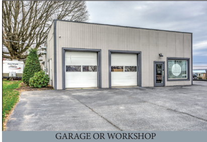
GARAGE OR WORKSHOP