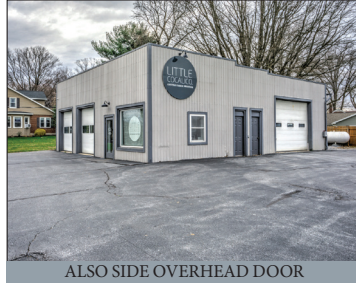
ALSO SIDE OVERHEAD DOOR