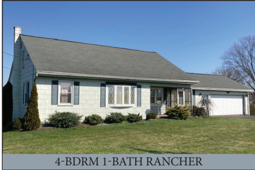
4-BDRM 1-BATH RANCHER