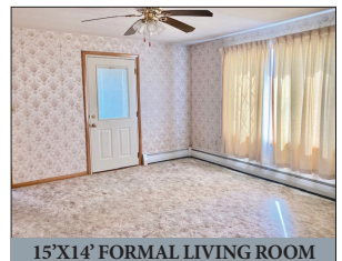
15'X14' FORMAL LIVING ROOM

FOR PHOTOS & COMPLETE LISTING VISIT www.martinandrutt.com