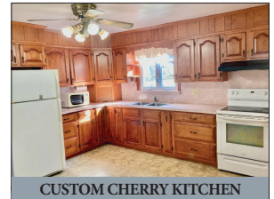
CUSTOM CHERRY KITCHEN

REAL ESTATE: Consists of a 2,772 sq. ft. 4-bedroom frame rancher w/attached garage on a .53-acre lot. Main floor features a spacious 15'x13.5' eat-in style raised panel cherry cabinetry kitchen w/ range, fridge & microwave; 13'x10.5' breakfast nook area; 10'x13' office or library w/bay window; attached 2-car garage; full bath; 15'x14' formal living room w/bay window; 14'x12.5' bedroom w/ closet; 14'x9.5' bedroom or laundry; covered front porch; rear deck; upper level includes 2-14'x15' bedrooms w/closets & 2-WIC w/under eave storage; good roof & insulated windows; 1,168 sq. ft. daylight basement has concrete floor, workshop area; canning storage; oil HW heat w/275 gallon fuel tank; on-site well & septic system; annual taxes: $2,978; 10'x14' storage shed; large garden area; nice wide paved driveway.