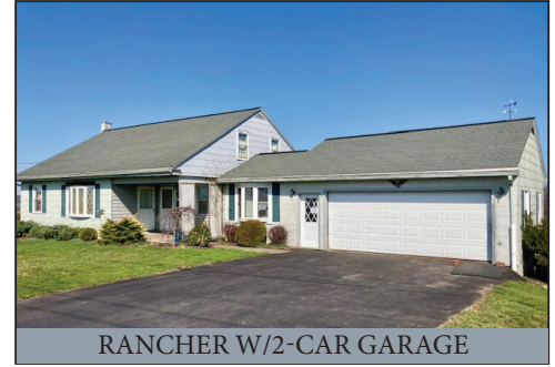
RANCHER W/2-CAR GARAGE

Located at 865 Centerville Rd. Ephrata, Pa. East Earl Twp. Lancaster Co.