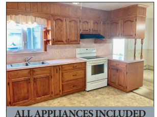
ALL APPLIANCES INCLUDED