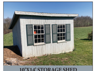
10'X14' STORAGE SHED