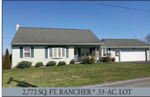
2,772 SQ. FT. RANCHER * .53-AC. LOT