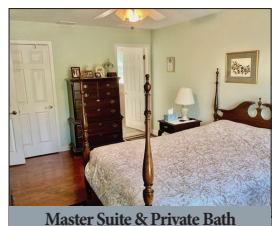
Master Suite & Private Bath