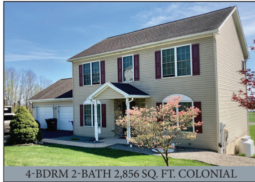
4-BDRM 2-BATH 2,856 SQ. FT. COLONIAL