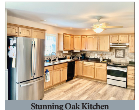
Stunning Oak Kitchen