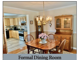
Formal Dining Room