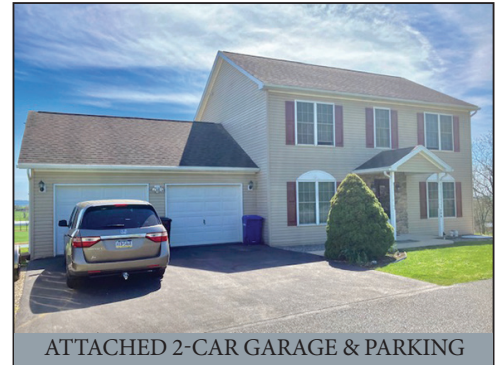
ATTACHED 2-CAR GARAGE & PARKING

Located at 206 Summitville Rd. New Holland, Pa. Earl Twp. Lancaster Co.