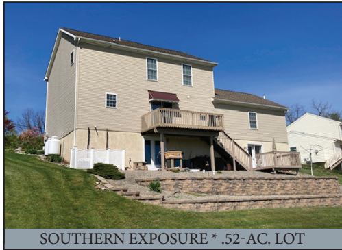
SOUTHERN EXPOSURE * .52-AC. LOT