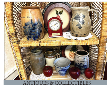
ANTIQUES & COLLECTIBLES

Located at 979 Oakview Dr. New Holland, PA 17557