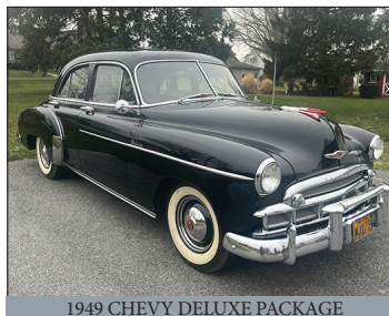
1949 CHEVY DELUXE PACKAGE