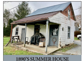
1890'S SUMMER HOUSE

OPEN HOUSE: SAT. JAN. 7 & 14 from 1-3 PM for info call/text auctioneer @ (717) 371-3333.