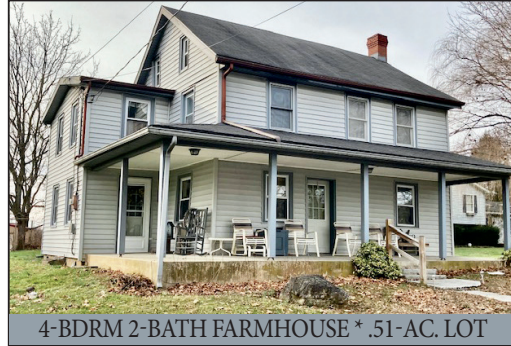
4-BDRM 2-BATH FARMHOUSE * .51-AC. LOT