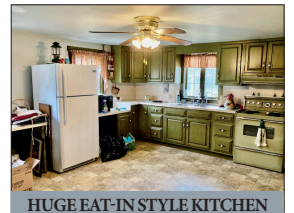
HUGE EAT-IN STYLE KITCHEN

For Photos & Listing visit www.martinandrutt.com