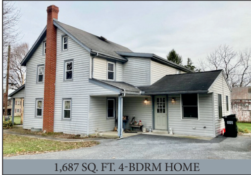
1,687 SQ. FT. 4-BDRM HOME