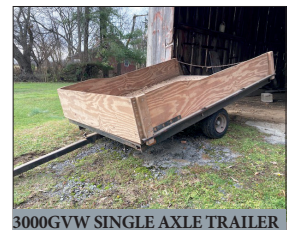
3000GVW SINGLE AXLE TRAILER