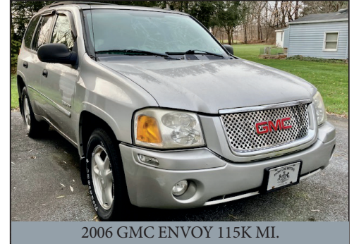
2006 GMC ENVOY 115K MI.

Located at: 699 E. Millport Rd. Lititz, Pa. Warwick Twp. Lancaster Co.