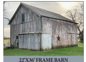
22'X36' FRAME BARN

REAL ESTATE: consists of a 4-bedroom 1,687 sq. ft. frame vinyl sided 2-story farmhouse, frame barn & summer house on a .51-acre rural lot. Main floor features a spacious 18'x18' eat-in style kitchen w/painted wood cabinetry, range, DW, fridge & pantry; full bath/laundry room w/W & D; mudroom; covered alcove porch; 12'x14' parlor; 12'x12' family room; 14'x16' living room; nice covered wrap-around front porch; 2nd level includes 4-bedrooms & full bath; walk-up attic storage; basement is unimproved w/outside access; 200 amp svc; oil furnace HW heat; 275 gallon fuel tank; on-site well & public sewer; annual taxes: $3,268. Outbuildings: a 22'x36' 2-story frame barn w/1-stall, shop area & garage bay; a 16'x24' 1890's summer house; nice level lot w/room for pasture or garden.