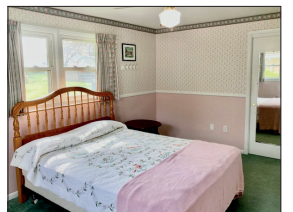
1-OF-3 BEDROOMS & 2-BATHS