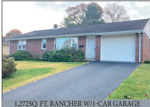
1,272SQ. FT. RANCHER W/1-CAR GARAGE