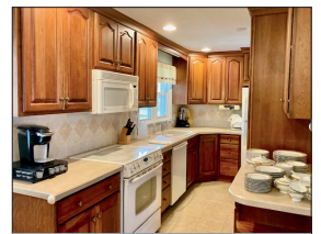
CUSTOM GALLEY STYLE KIT.