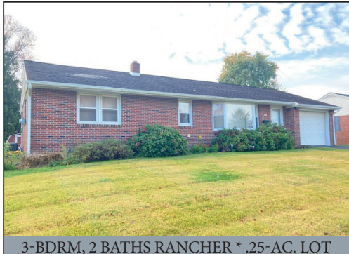
3-BDRM, 2 BATHS RANCHER * .25-AC. LOT