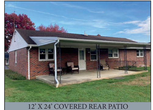
12' X 24' COVERED REAR PATIO

Located at: 422 W. Cedar St. New Holland, Pa. 17557