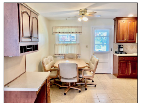
DINING AREA W/NEW FLOORING