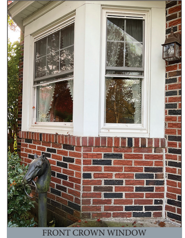
FRONT CROWN WINDOW

DIRECTIONS: From Rt. 501 in Lititz, turn East (at the traffic light) on E. 2nd St., to right turn on Cherry St., to property on right.