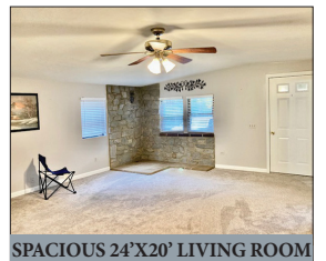
SPACIOUS 24'X20' LIVING ROOM