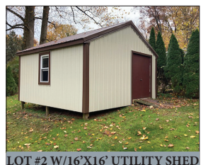
LOT #2 W/16'X16' UTILITY SHED