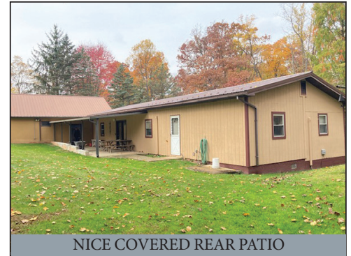
NICE COVERED REAR PATIO

Located at: 240 Lancaster Ave. Lititz, PA Elizabeth Twp. Lancaster Co.