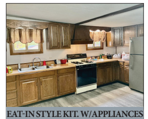
EAT-IN STYLE KIT. W/APPLIANCES

For Photos & Listing visit www.martinandrutt.com