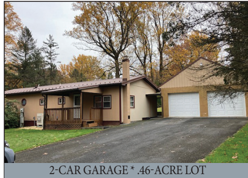
2-CAR GARAGE * .46-ACRE LOT