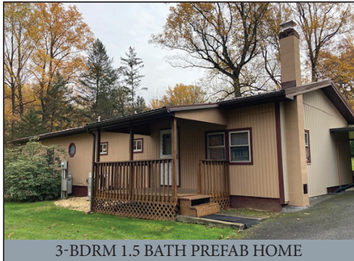
3-BDRM 1.5 BATH PREFAB HOME