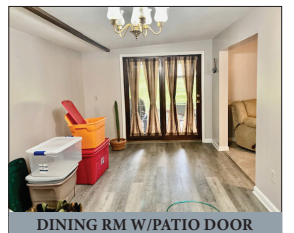
DINING RM W/PATIO DOOR