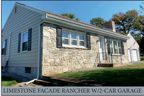
LIMESTONE FACADE RANCHER W/2-CAR GARAGE