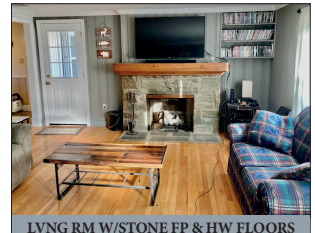
LVNG RM W/STONE FP & HW FLOORS