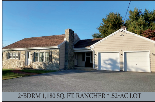
2-BDRM 1,180 SQ. FT. RANCHER * .52-AC LOT