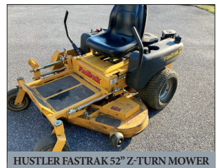
HUSTLER FASTRAK 52" Z-TURN MOWER