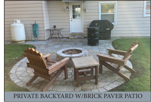
PRIVATE BACKYARD W/BRICK PAVER PATIO

Located at 307 W. Main St. Leola, Pa. Upper Leacock Twp. Lancaster Co.