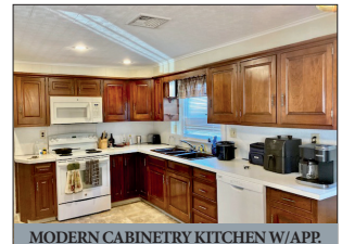
MODERN CABINETRY KITCHEN W/APP.

OPEN HOUSE: Sat. Nov. 12 & 19 from 1-3 PM for info call/text auctioneer @ (717) 371-3333.