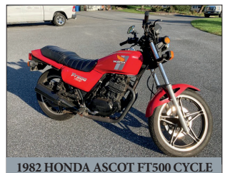
1982 HONDA ASCOT FT500 CYCLE