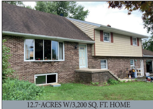
12.7-ACRES W/3,200 SQ. FT. HOME