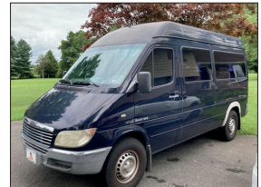
2003 SPRINTER 10-PASS VAN

Terms: Cash, PA check or credit card w/3% fee; food truck, sale held under tent, bring a chair!