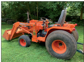
KUBOTA B9200 4WD TRACTOR

Located at: 480 Swamp Bridge Rd. Denver, Pa. W. Cocalico Twp. Lancaster Co.