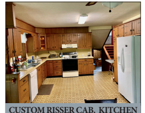
CUSTOM RISSER CAB. KITCHEN

* 12.7-Acre Farmette * 4-Bdrm., 2-Bath House * 30' x 60' Pole Barn * Annual Taxes: $3,245 Clean & Green * W. Cocalico Twp., Lanc. Co.