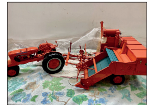
AC TRACTOR & COMBINE