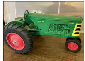
OLIVER 1/16TH SCALE TRACTOR