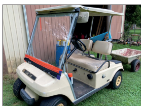
CLUB CAR GOLF CART

Tractors, ATV's, Trailers, Van: blue 2003 DSL 2500 SHC Sprinter 10-pass van, 157k mi; Kubota 4WD B9200 tractor w/BF350 bucket loader; Allis Chalmers "G" tractor; 2-Honda 300 ATV's; Suzuki 50cc ATV; 3500GVW Burkholder 16' open trailer; 2002 7000GVW 14' cargo trailer; Club Car golf cart; Yazoo/Keys Z-turn mower; MTD Z-turn mower; 10" Craftsman band saw, drill press; 6" jointer; Ryobi miter saw; tool chests on wheels; lots of misc hand & power tools; chain saw; trim mowers; wheelbarrow; log chains; traps; shop cart; lumber & windows; 2-air compressors; 2-man & ice saws; etc.