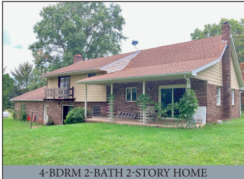
4-BDRM 2-BATH 2-STORY HOME

12.7-ACRE FARMETTE * 4-BDRM HOUSE w/2-CAR GARAGE 30'x60' POLE BARN * 7-ACRES TILLABLE KUBOTA 4WD TRACTOR * 2-HONDA 300 ATV's * 2003 SPRINTER VAN 2-TRAILERS * 100+ VINTAGE FARM TOYS * A/C "G" TRACTOR * TOOLS SATURDAY, NOVEMBER 5, 2022 @ 9-AM/Real Estate @ 1:30 PM