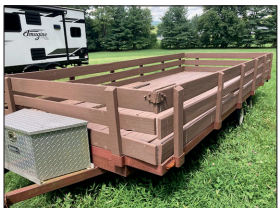
BURKHOLDER 16' TRAILER