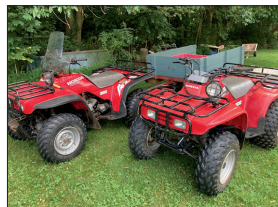
2-HONDA 300 ATV'S