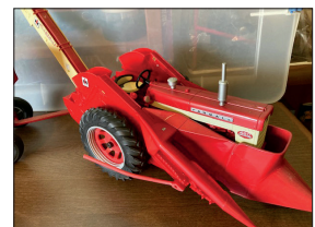
IH TRACTOR & CORN PICKER