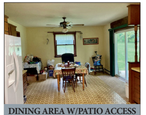
DINING AREA W/PATIO ACCESS

OPEN HOUSE: SAT. OCT. 15 & 22 from 1-3 PM for info call/text auctioneer @ (717) 371-3333