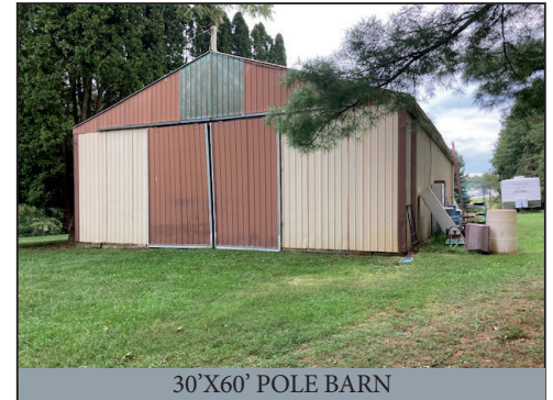
30'X60' POLE BARN

Located at: 480 Swamp Bridge Rd. Denver, Pa. W. Cocalico Twp. Lancaster Co.