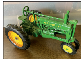
JD 1/16TH SCALE TRACTOR