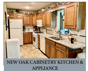
NEW OAK CABINETRY KITCHEN & APPLIANCE