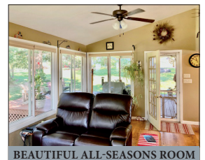
BEAUTIFUL ALL-SEASONS ROOM