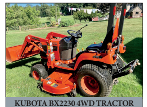
KUBOTA BX2230 4WD TRACTOR

TERMS: Cash, PA check or Credit Card w/3% fee. Sale held under tent bring a chair, food by GSFR aux.