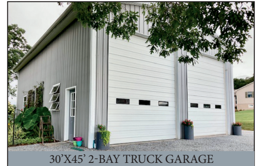
30'x45' 2-BAY TRUCK GARAGE

Located at: 468 Meetinghouse Rd. Gap, PA Salisbury Twp. Lancaster Co.