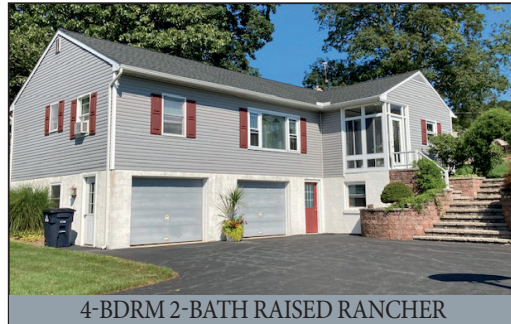
4-BDRM 2-BATH RAISED RANCHER