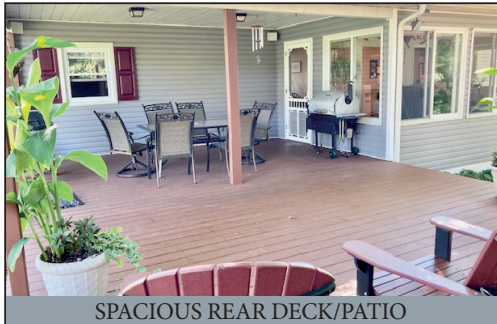
SPACIOUS REAR DECK/PATIO

4-BDRM 2-BATH RAISED RANCHER w/2-CAR GARAGE * .86-AC. LOT 30'x45' TRUCK GARAGE * 4WD KUBOTA TRACTOR * HUSTLER MOWER WOOD SHOP EQUIP * SNAP-ON WELDER * TOOLS * PERSONAL PROPERTY THURS., NOVEMBER 3, 2022 @ 4-PM/Real Estate @ 5:30-PM