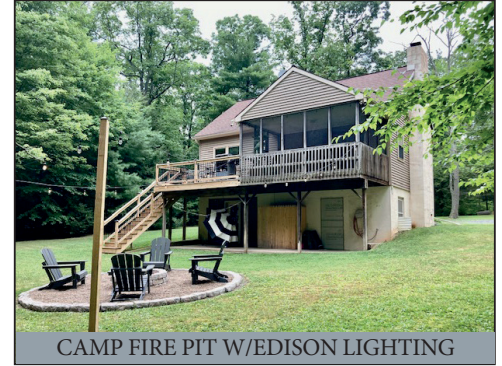
CAMP FIRE PIT W/EDISON LIGHTING

Located at: 44 Knarr Ln. Belleville, PA Union Twp. Mifflin Co.