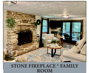
STONE FIREPLACE * FAMILY ROOM