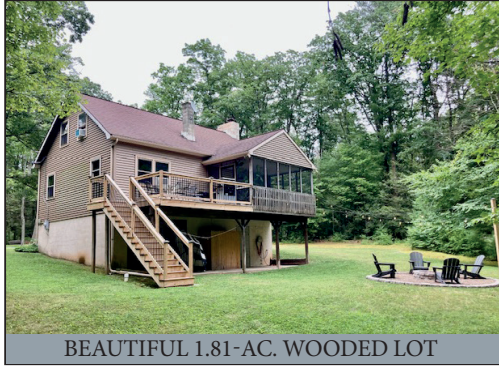
BEAUTIFUL 1.81-AC. WOODED LOT