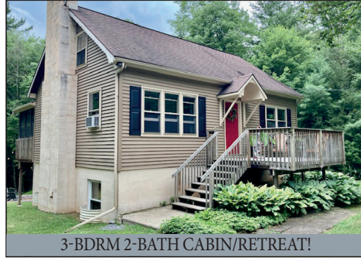
3-BDRM 2-BATH CABIN/RETREAT!