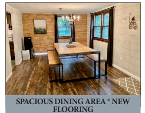
SPACIOUS DINING AREA * NEW FLOORING

For complete listing visit www.martinandrutt.com