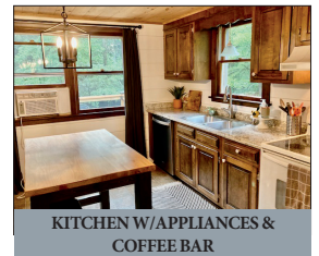
KITCHEN W/APPLIANCES & COFFEE BAR