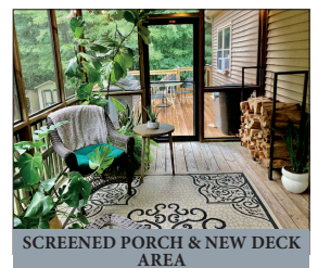
SCREENED PORCH & NEW DECK AREA