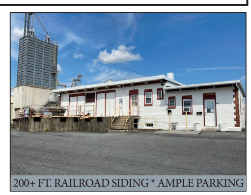
Located at: 217 S. Railroad Ave. New Holland, Pa. 17557

<u>DIRECTIONS:</u> From Main St. (Rt. 23) New Holland take S. Railroad Ave 1-block to property on left.