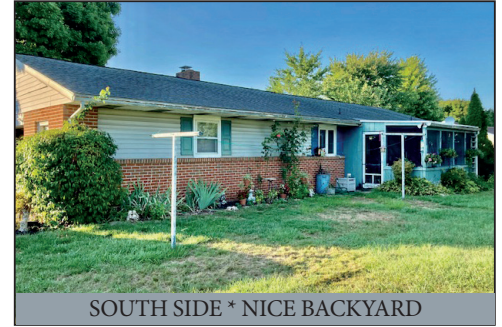
SOUTH SIDE * NICE BACKYARD

Located at: 921 N. State St. Ephrata, PA Ephrata Twp. Lancaster Co.