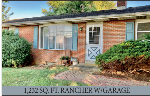
1,232 SQ. FT. RANCHER W/GARAGE