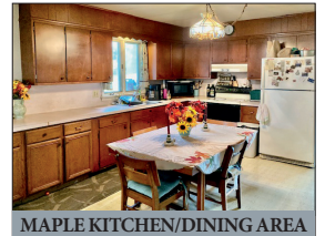
MAPLE KITCHEN/DINING AREA

Terms: Cash, PA check, credit card w/3% admin fee, Great Food by Black Diamond Catering; sale under tent bring your chair!