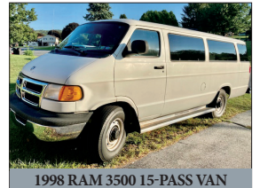
1998 RAM 3500 15-PASS VAN