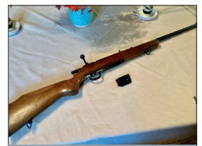
GLENFIELD MOD 25 .22 RIFLE