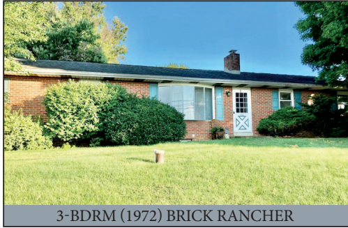
3-BDRM (1972) BRICK RANCHER

3-BDRM BRICK RANCHER w/2-CAR GARAGE * .43-AC. LOT VEHICLES * ANTIQUES * GUNS * JEWELRY * QUILTS SAT. OCTOBER 22, 2022 @ 9-AM/Real Estate @ 12 NOON