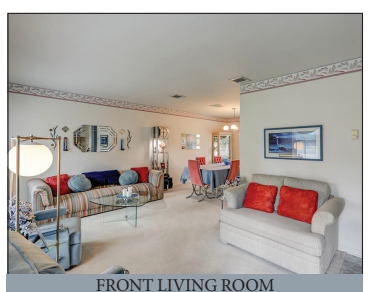
Located at 225 Pine Lane New Holland Pa. 17557

<u>DIRECTIONS</u> : From W. Main St. in New Holland, travel North on Mentzer Ave, to left on W. Spruce, to first left on Pine Lane (short Cul-De-Sac Street).