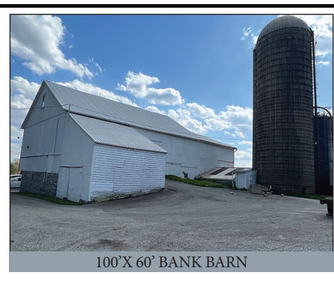
Located at 819 & 821 Penn Grant Rd. Lancaster Pa. 17602

<u>DIRECTIONS:</u> From the traffic light in Lampeter, travel South on Lampeter Rd. for 1 mile (turns into Penn Grant Rd.) to property on right.