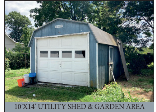
10'X14' UTILITY SHED & GARDEN AREA

Located at: 148 W. Main St. Leola, PA Upper Leacock Twp. Lancaster Co. CV Schools