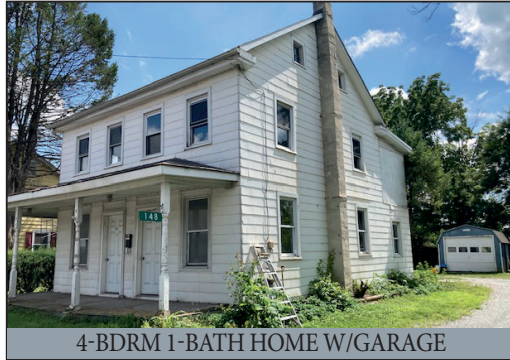
4-BDRM 1-BATH HOME W/GARAGE