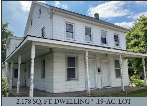
2,178 SQ. FT. DWELLING * .19-AC. LOT

4-BDRM 1-BATH 2-STORY DWELLING * .19-AC. LOT 2-CAR GARAGE & UTILITY SHED * GARDEN AREA THURSDAY, OCTOBER 13, 2022 @ 6-PM